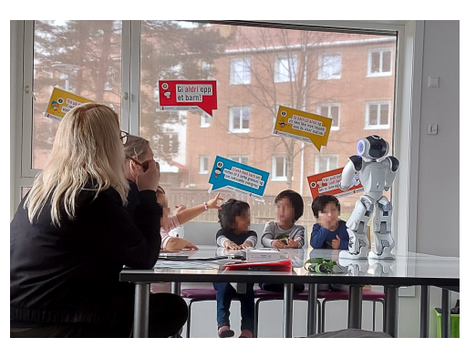
(b) Main trial

Figure 2. In situ stills from the trials.