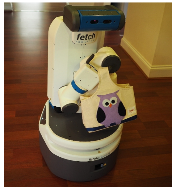
Figure 1: The Fetch robot at Robot House, its arm configuration, and the basket used for the experiment.

Modeling and exhibiting social signals appropriately can aid the robot in communicating its current state [19] and guide users through an interaction situation [23].